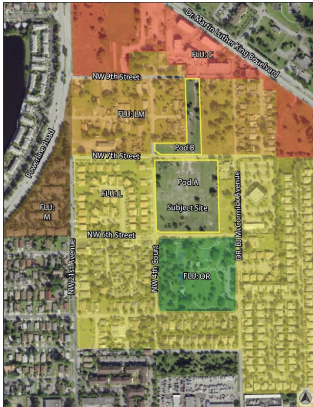
Subject Site – FLU Map