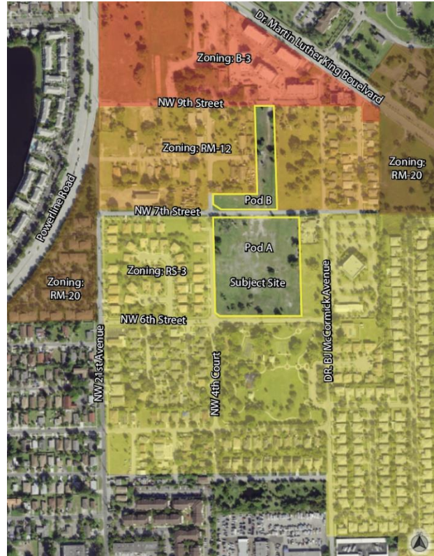
Subject Site – Zoning Map